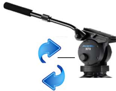
Counter Balance Adjustment